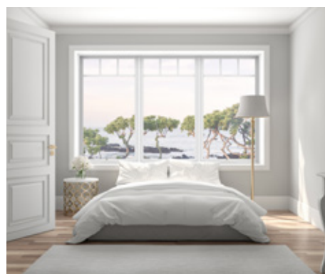
Newport Series - Single

Please discuss your specification with an A&L sales representative to ensure your desired aesthetic can be achieved.