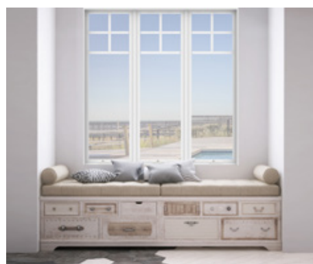
Newport Series - Double