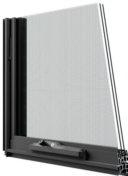
Aluminium screen fixed internally, with cam catches