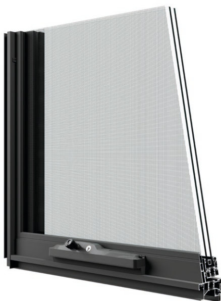
Aluminium screen fixed internally