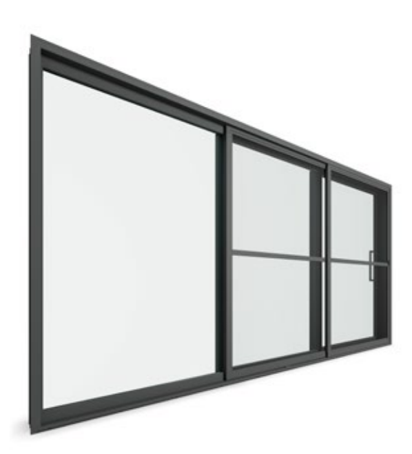
Aluminium stacking screen fixed externally