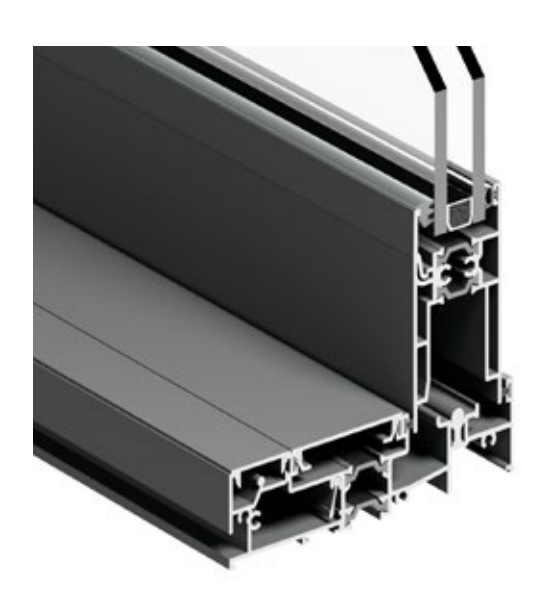
Thermally broken frames tick all the boxes when it comes to durability, design, flexibility, and energy performance.