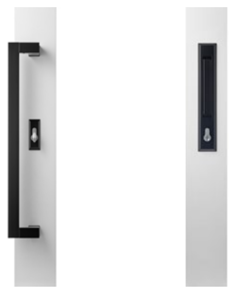
D handle (inside or outside)